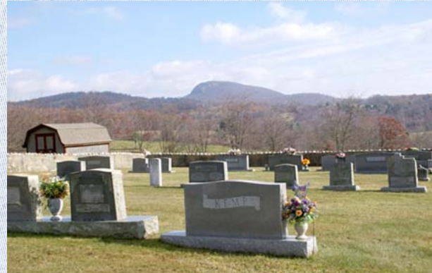
Buffalo Mountain viewed across the Church Cemetery