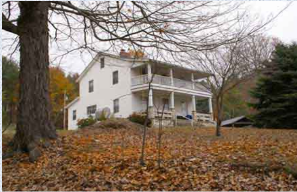
Manse, located around the turn on Childress Road