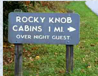
Driving North on Blue Ridge Parkway