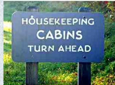
Driving South on Blue Ridge Parkway